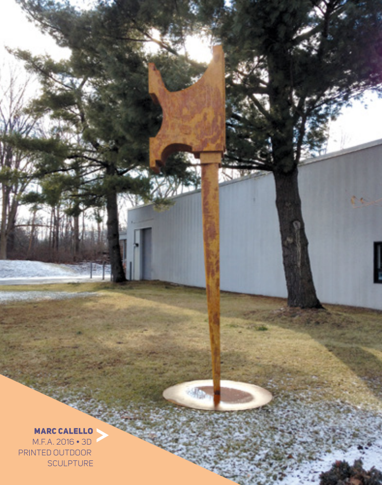
▶ MARC CALELLO M.F.A. 2016 • 3D PRINTED OUTDOOR SCULPTURE