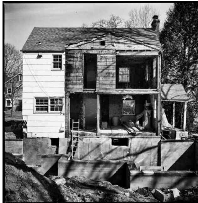
The Nest 30"x 32" Kodak TMAX 120; Digital Archival Print 2014