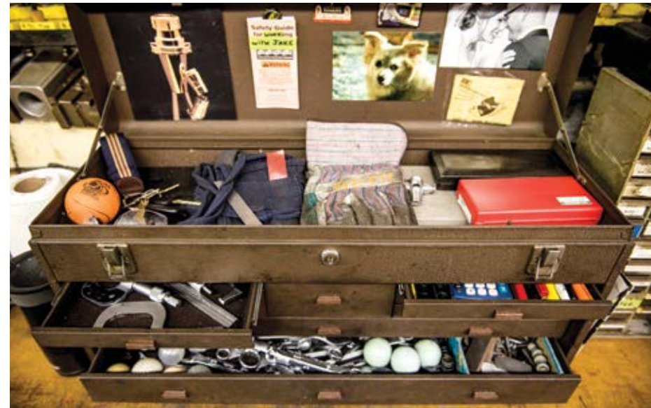
Mine 44"x 60" Digital Print 2014