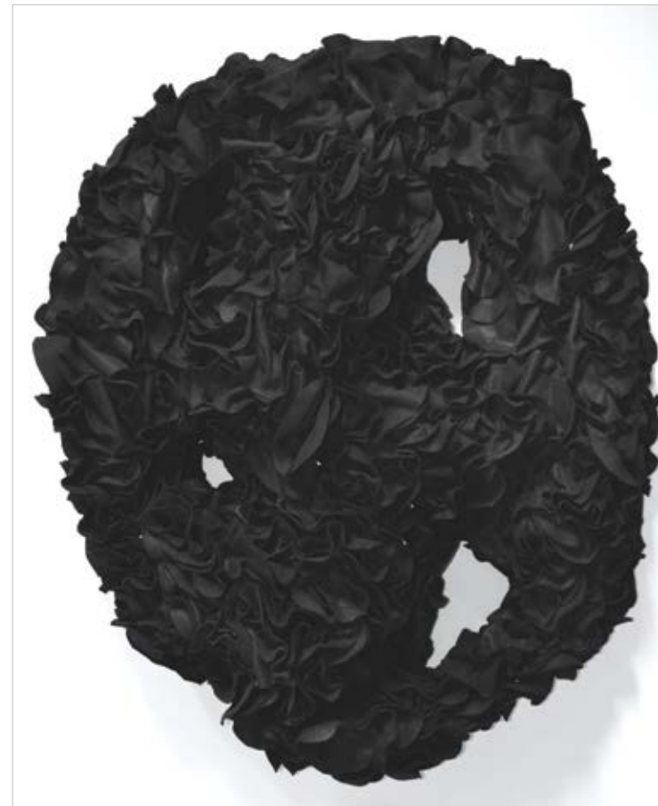
Scan III 52"x44"x11" Paper mache and felt 2015