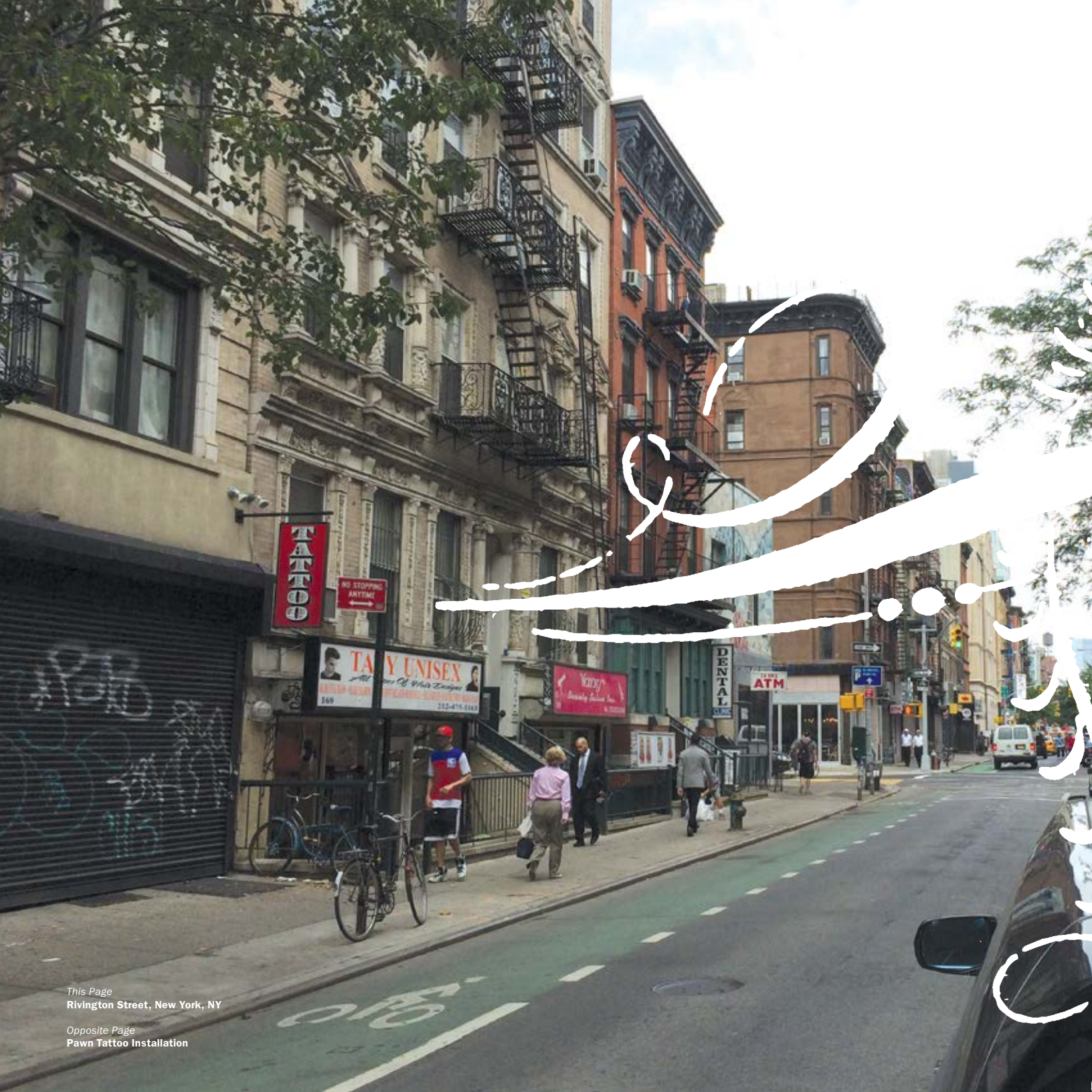
This Page Rivington Street, New York, NY