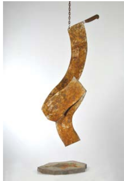
Clever Dimensions Variable Mixed Media 2015