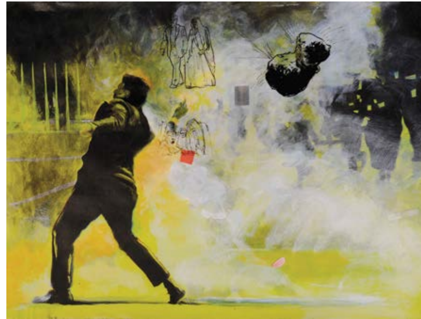
Lawyer Pakistan 22"x 30" mixed media 2015