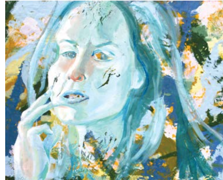
Untitled 16"x20" Oil and encaustic 2015