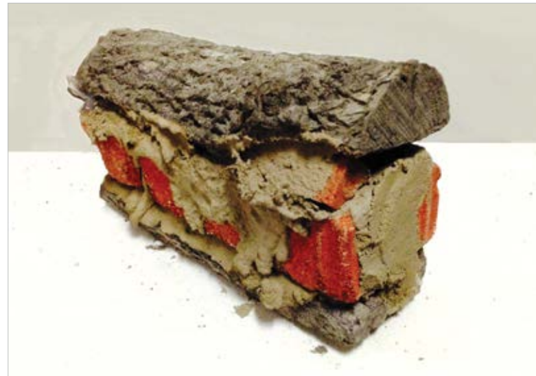
Sandwich 12" x 5" x 8" Mixed Media 2015