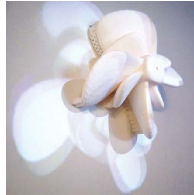
Untitled Dimensions Variable Digital Projection 2015