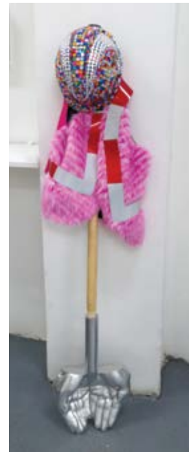
Work Dimensions Variable Mixed Media 2015