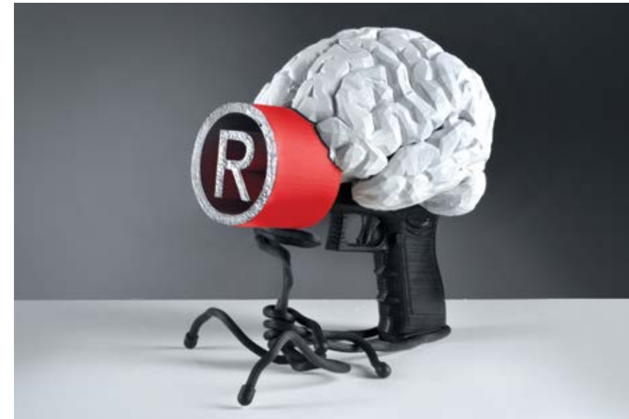
Origins Dimensions Variable Mixed Media 2014