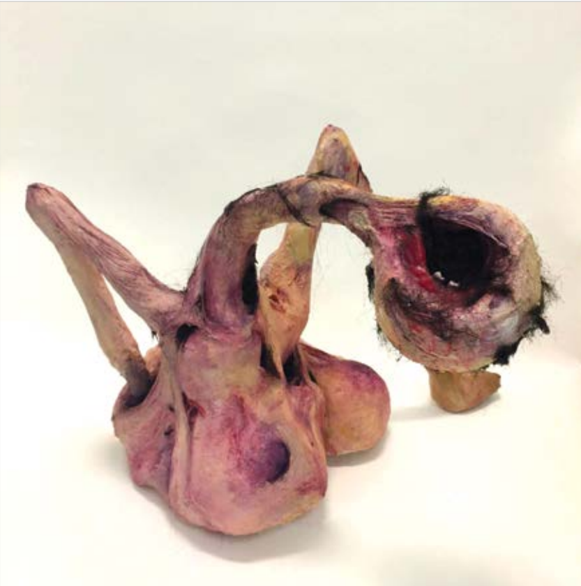
Figure Study with Bile 33"19"x22" Styrofoam, paper mache, latex, acrylic 2015