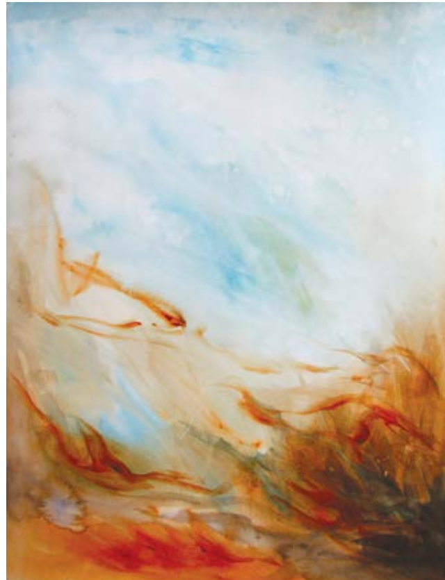
Untitled 22" x 30" Acrylics on Watercolor paper 2015