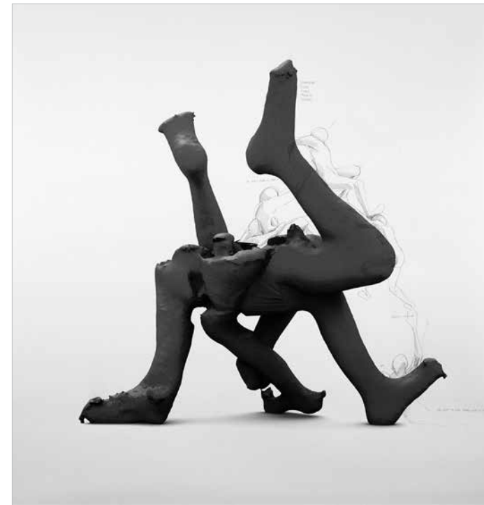
42 x 42 #3 42"x 42" Inkjet print and Graphite 2015