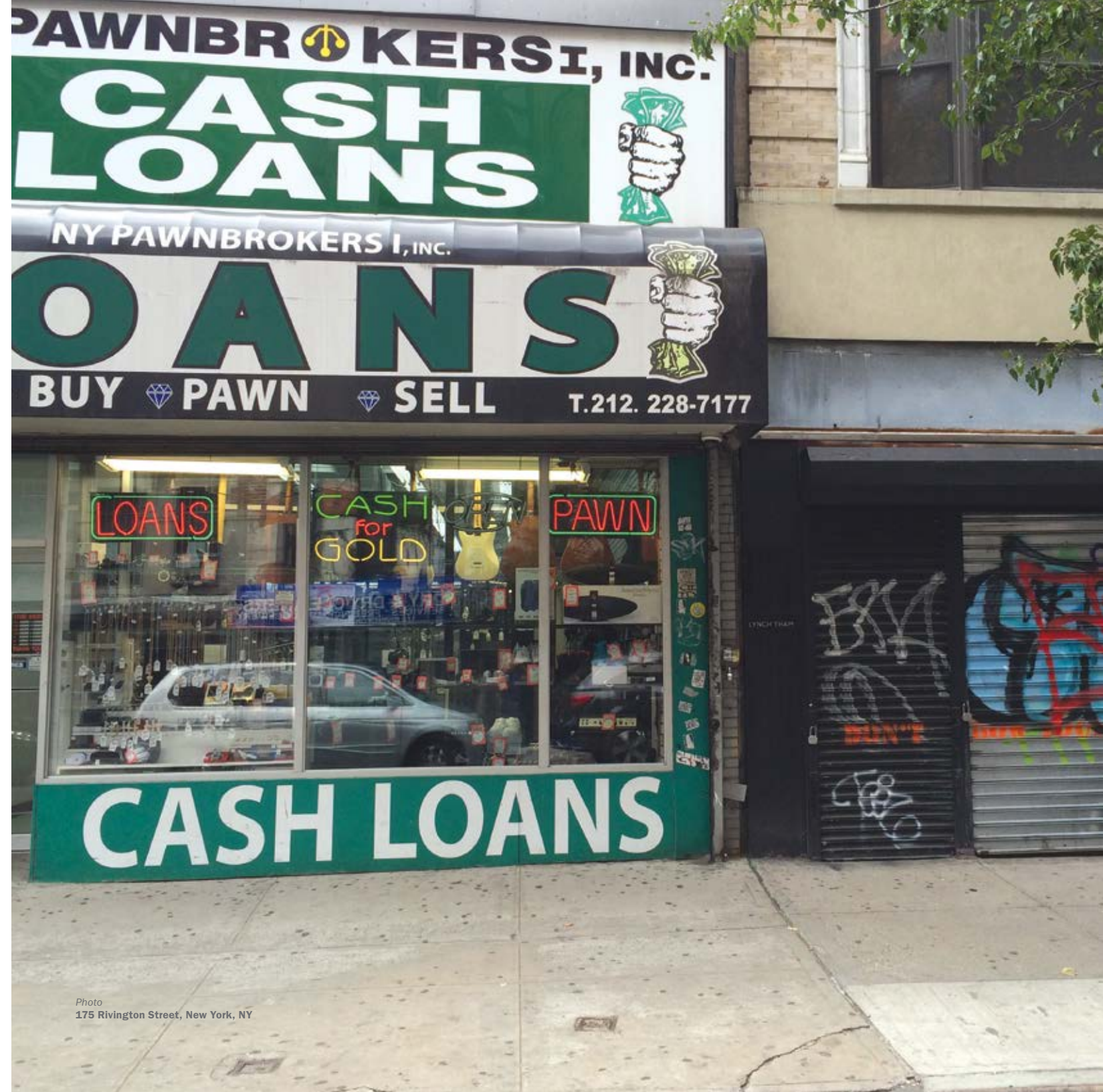
Photo 175 Rivington Street, New York, NY