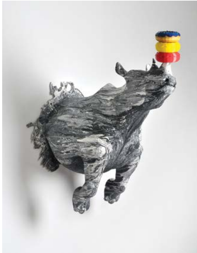
Untitled 42x36"x32" Polystyrene, House Paint, 3D Print 2014