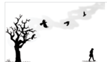
Doppelgänger 8.25" x 10.5" Ink and paper with digital compositing Selected spreads 2015